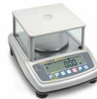
Weighing plate B

Draught shield standard for all models with weighing plate size A B Removable metal cover with pipette opening. Weighing space WxDxH 158x143x64 mm