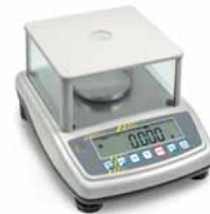
Weighing plate A

Mains adapter: 230 V/50Hz in standard version for Germany. On request GB, AUS or USA version.