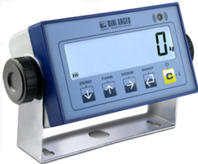
DFWL: multifunction weight indicator.