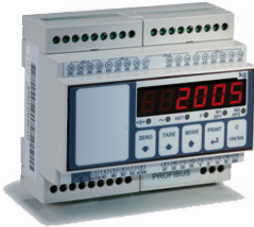
Digital weight transmitter/indicator, ideal as junction box.