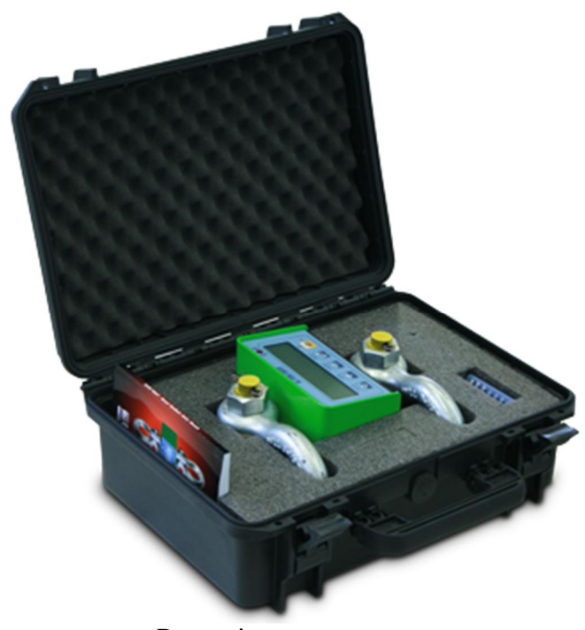
Protective transport case