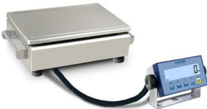
The indicator can be mounted attached to the platform or it can be installed in any desired position, enabling the weighing of bulky objects.

Bench scale with weight indicator designed which can either be mounted attached to the platform or it can be mobile for remote positioning, thanks to the stretchable cable. Available also CE-M APPROVED for legal for trade use.