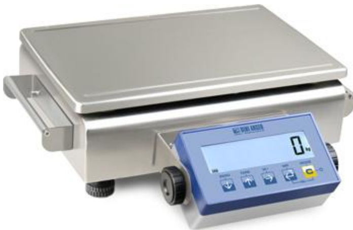
Bench scale with weight indicator attached to the platform