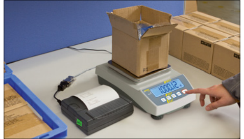
Plus/minus weighing procedures For example for checking piece weight, production control, for manufacturing packages of equal weight, etc. The deviation of the test items from a defined target weight will be displayed using the respective "+" and "-" symbols.